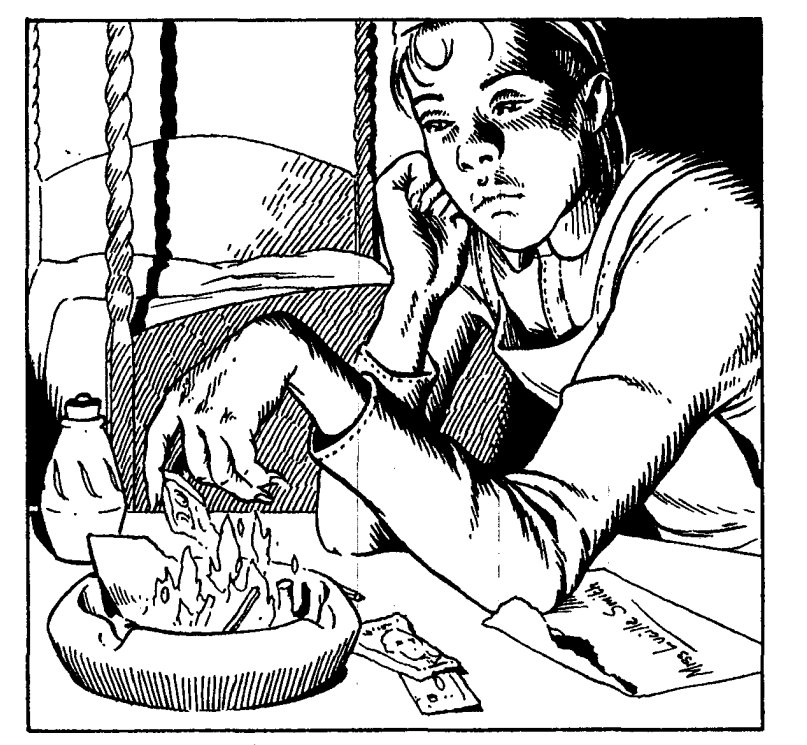
She tore the $20 bill into bits and added these to the fire.

three cigarettes were smoked and she would have liked another, she put them in her top drawer so that they could not tempt her.