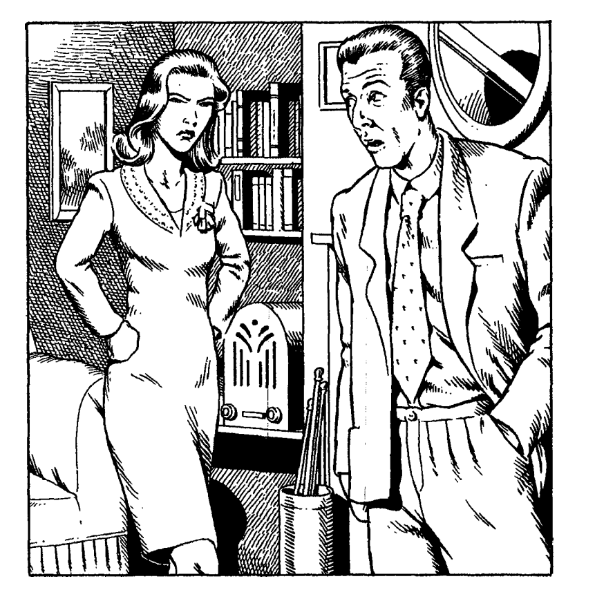
'The postman?' he said, staring.

'Get out!' I told him, but he didn't move.