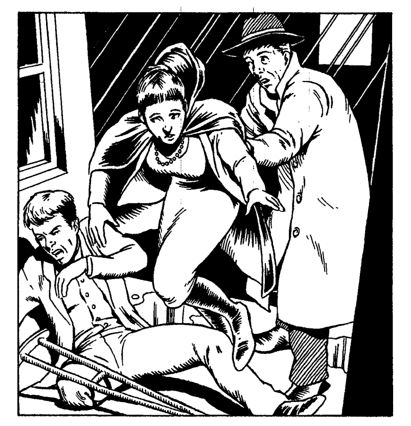
I pushed the princess into the nearest doorway.

The boy smiled as he got up. 'I'm not hurt, but you scared me, jumping on me like that.'