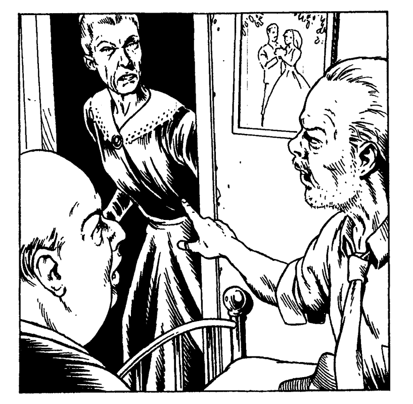
'Did you have your ear at the door long enough to hear everything I said?'

Her face remained calm. 'I'm not in it. I came to tell you that your dinner is ready.'