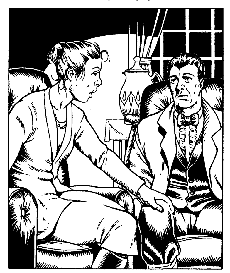
'There is wealth beneath the garage:

'You said a little while ago that you didn't care who I was,' she began. 'But I want you to know. There are so many of us Russians who were once important people but who are now