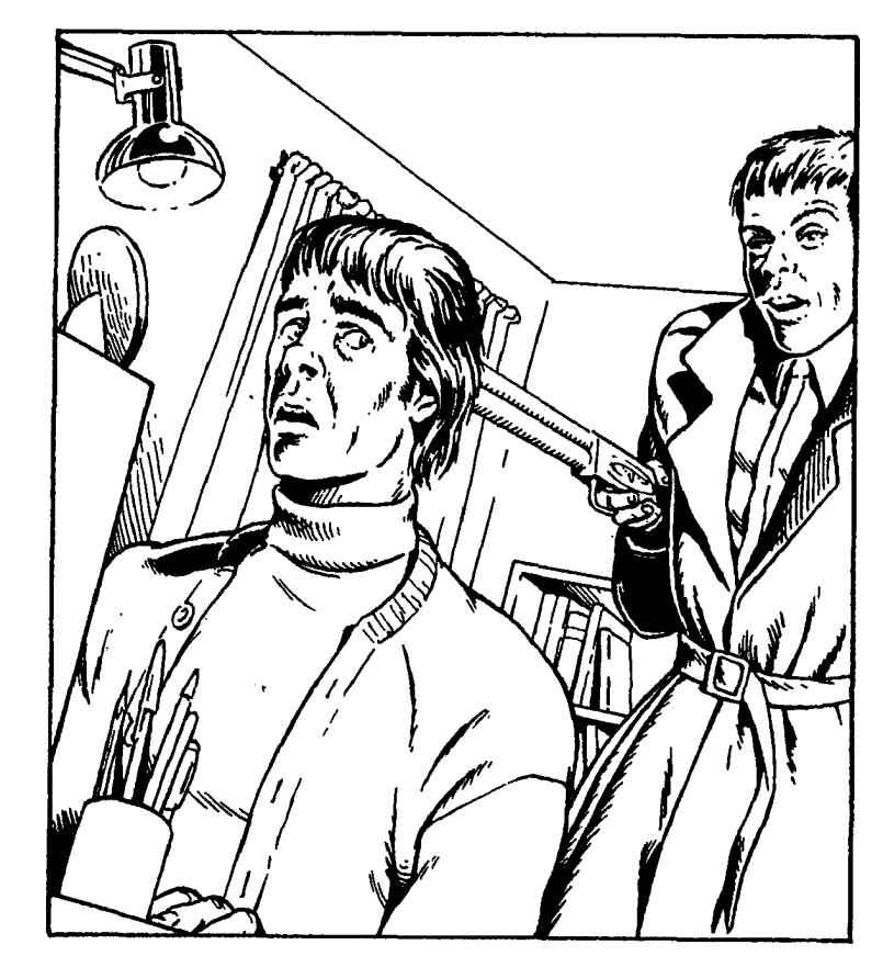
'Just write the note.'

Wright did not exactly believe him, but the gun at his head left him little choice. He wrote the note and signed his name.